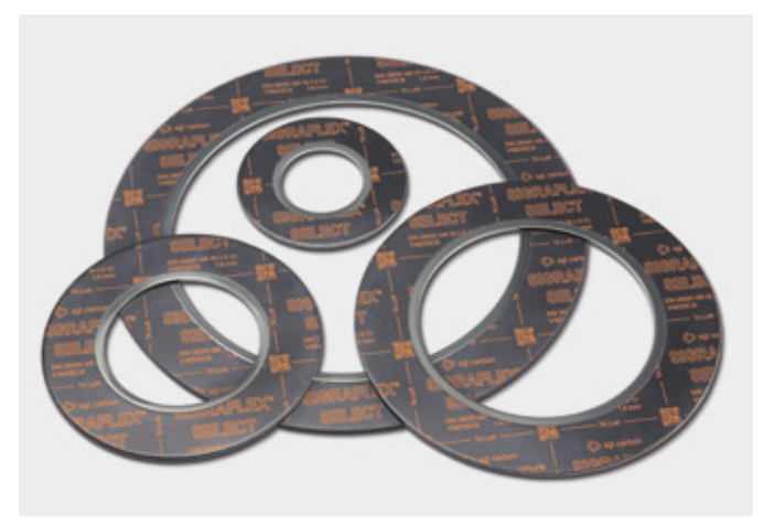
↑ Gaskets made from SIGRAFLEX SELECT