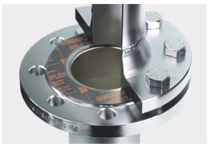
↑ Flange with SIGRAFLEX SELECT gasket