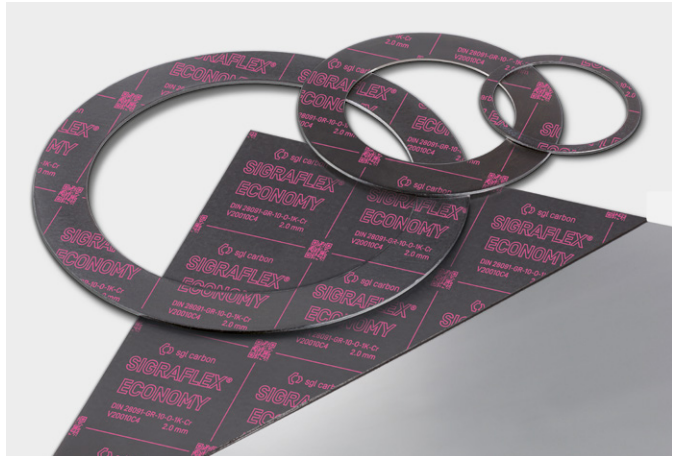
↑ SIGRAFLEX ECONOMY sealing sheets and gaskets