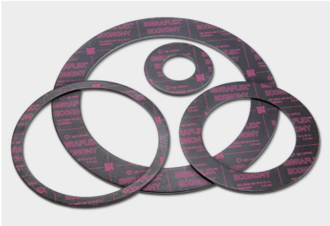
↑ Gaskets made from SIGRAFLEX ECONOMY