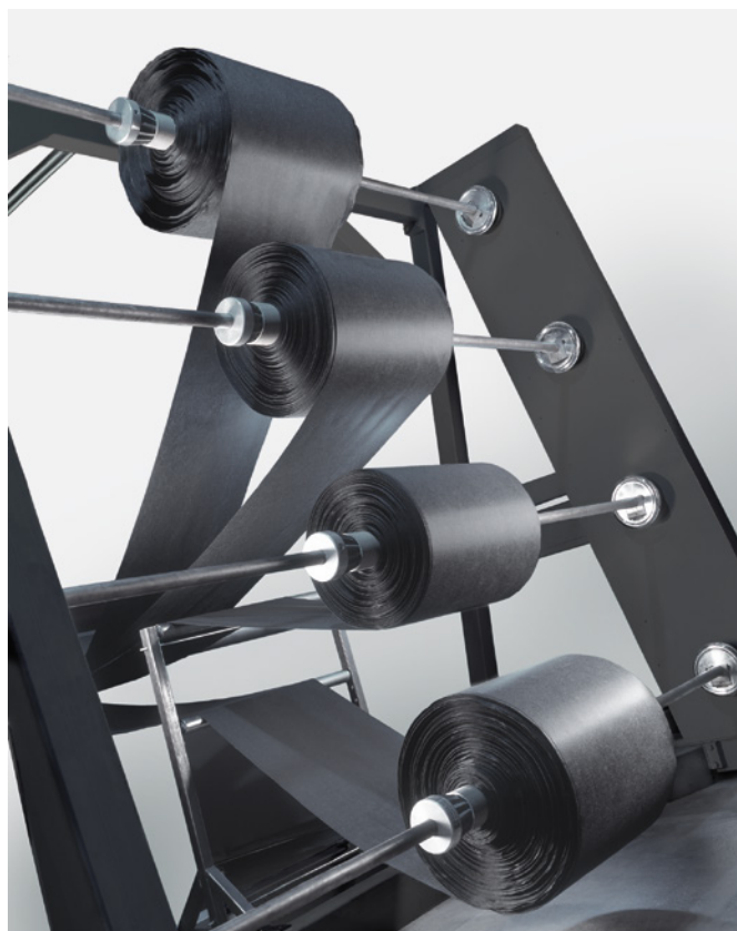
↑ SIGRACET GDL optimized gas diffusion layers

Optimized gas diffusion layers for PEM and DMFC fuel cell applications