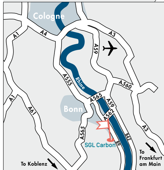
Motorway around Cologne/Bonn

SGL CARBON GmbH Drachenburgstraße 1 53170 Bonn/Germany Phone +49 228 841-0